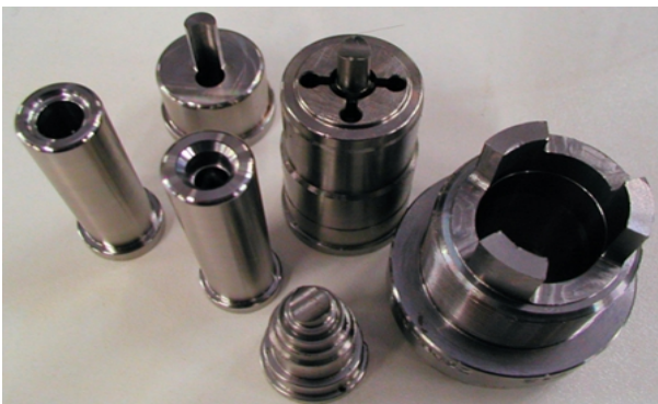
Precision parts from the PRES BLOCK shop

Pres Block's technical department designs parts/molds and writes NC-code for their machines, which must also run during night-shifts, when no engineering staff is present.