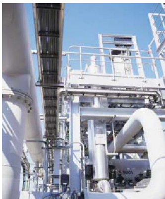
food processing solution

STORK FOOD & DAIRY SYSTEMS located in the midst of Amsterdam is only one of the worldwide 50 plants of STORK N.V. The company